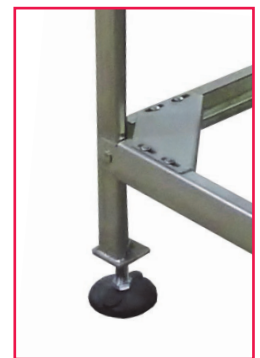
Adjustable levelers with easy clean channel legs.

The Eaglestone 1600 turntable is available in sizes ranging from 2' ft. diameter to 10' ft. diameter. The standard table top is 7ga (.1875") thick stainless steel with solid UHMW-PE support wheels for quiet, smooth operation.